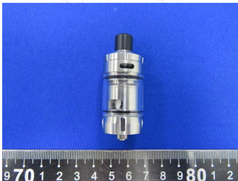
GEEKVAPE ZEUS NANO TANK