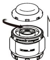
Twist to open top cap ②