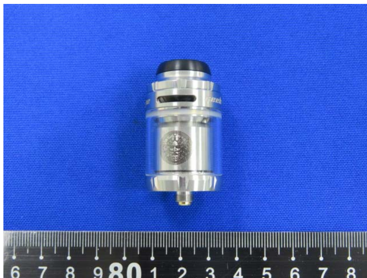
GEEKVAPE ZEUS X MESH RTA 2ML with 0.2ohm KA1