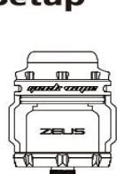
Get the product ①