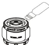
Fill with liquid ③