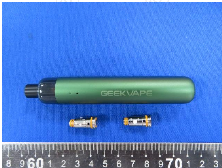
WENAX S-C 0.6ohm KA1 (13-18W)/ 1.2ohm KA1(10-12W)