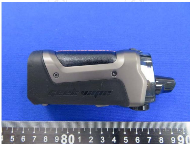
GEEKVAPE AEGIS BOOST PLUS KIT