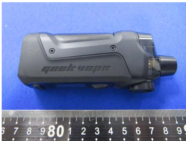
GEEKVAPE AEGIS BOOST PRO KIT