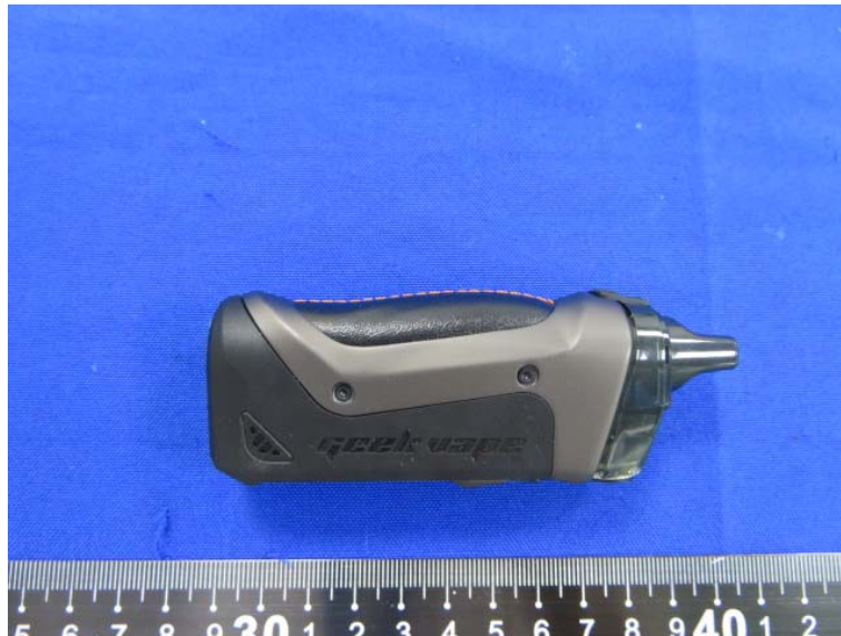
GEEKVAPE AEGIS BOOST KIT 2ML