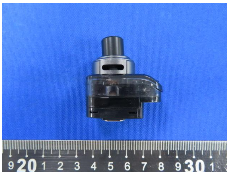
Obelisk 65 Cartridge 0.2ohm FeCrAl(50-58W)/0.4ohm FeCrAl(25-33W)