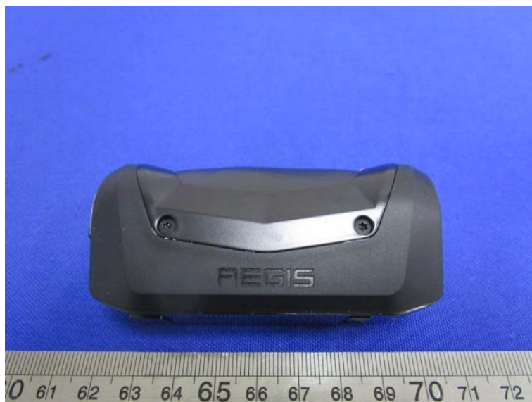
GEEKVAPE AEGIS MINI MOD