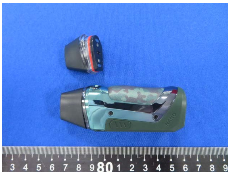
AEGIS NANO KIT with 0.6ohm FeCrAl (20-25W)/1.2ohm FeCrAl (11-14W)